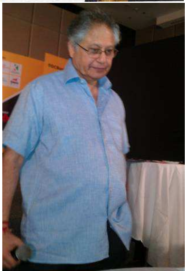
Feedback by participants from Coconut Development Board